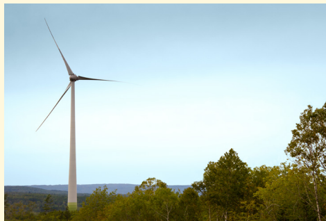
Figure 1.2 —Below is a sampling of community-based green energy projects Bullfrog Power is helping to fund across Canada. To date, the company has provided funding to more than 130 of these projects across Canada.

Bullfrog Power financially supported the Ellershouse Wind Farm in Nova Scotia, the first wind development in N.S. to be funded and built independently of the local power authority or any provincial government incentive program.